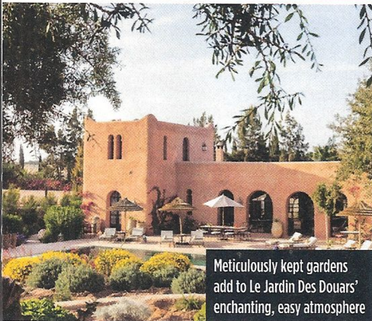
Meticulously kept gardens add to Le Jardin Des Douars' enchanting, easy atmosphere

LAURA'S TIP For home-style cooking, Adwak in Essaouira's Medina is cheap - £14 for two - and the beef meatball tagine is a melt-in-the-mouth lunch.