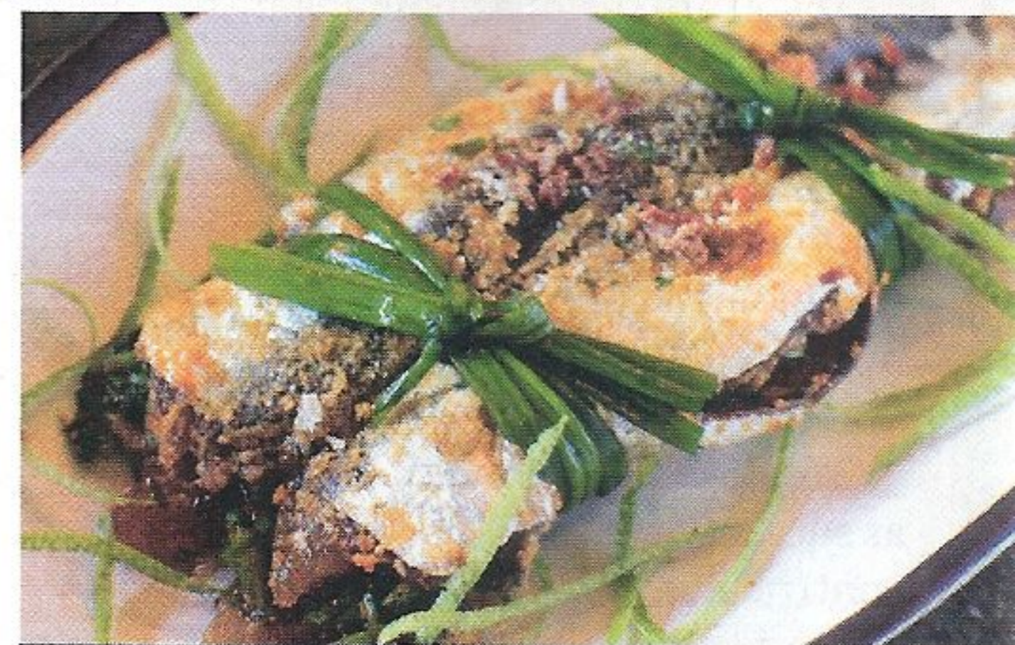
From the food to the stunning bedrooms, expect unfussy luxury

With temperatures up to 28° in summer the adults-only infinity pool is ideal if you want to lounge, sizzle, dip and repeat. But Le Jardin is perfect if you're travelling with your little ones too. There's a dedicated family pool and a child-friendly menu with favourites like spag bol. Adults can dine later if they wish in the couples restaurant, with Moroccan dishes including daily tagines. Even breakfast is a treat - don't miss the crêpes with figs and honey.