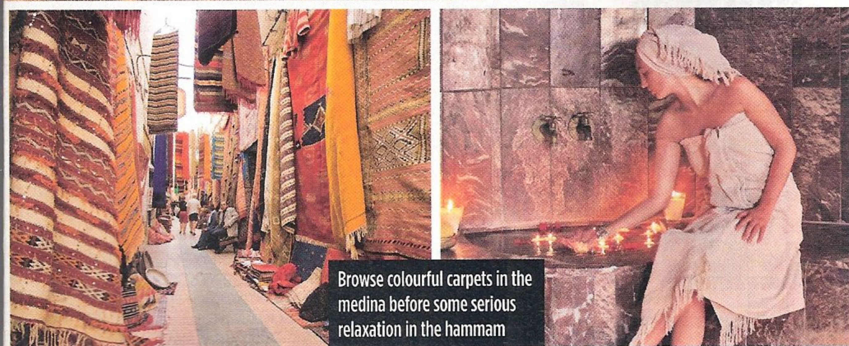
Browse colourful carpets in the medina before some serious relaxation in the hammam