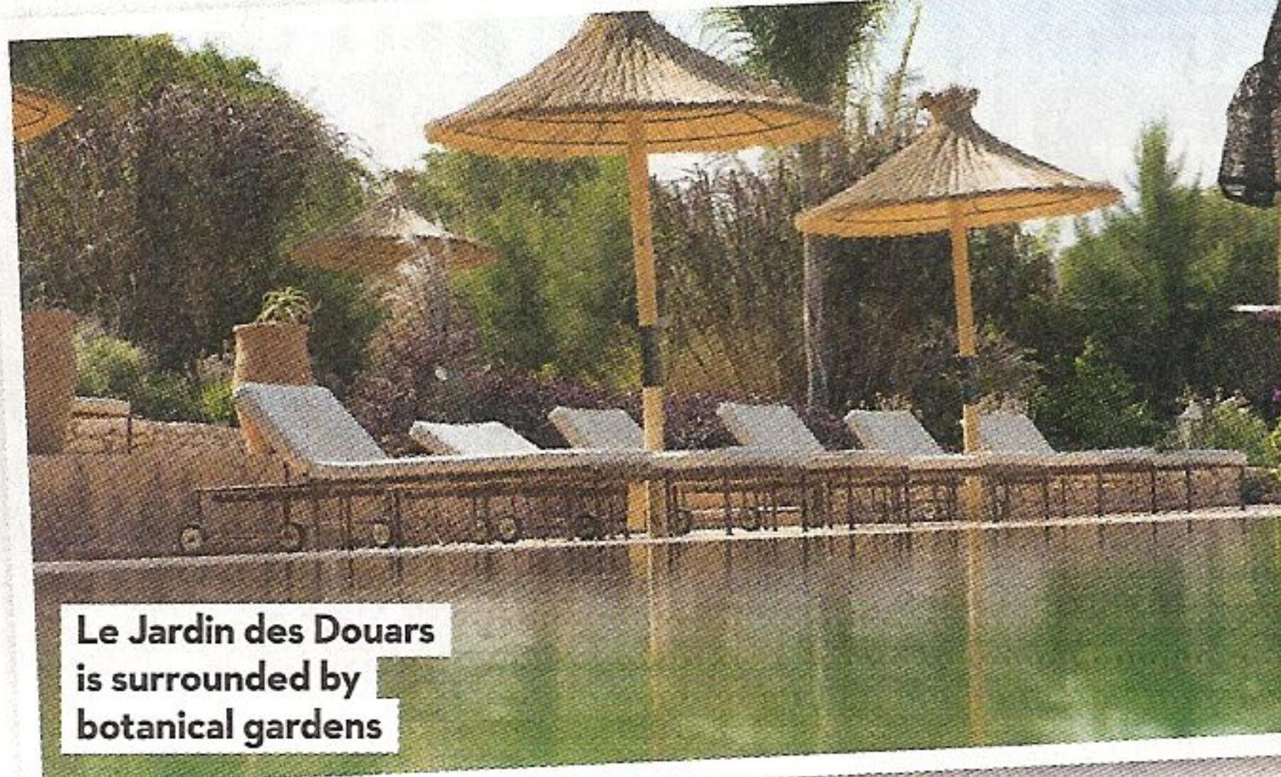
Le Jardin des Douars is surrounded by botanical gardens