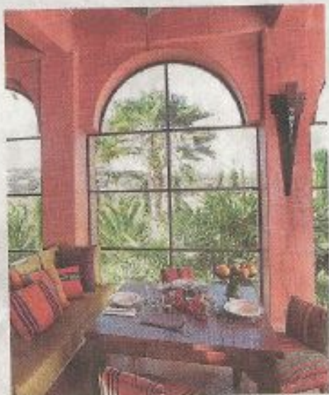
SUMPTUOUS: Take breakfast in the peaceful oasis

Le Jardin des Douars (dialling from the UK: 00 212 524 47 4003/jardin-desdouars.com) offers doubles from £150. B&B, easyJet (0330 365 5000/easyjet.com) offers return flights from Luton to Essaouira from £43. Morocco tourism: visitmorocco.com