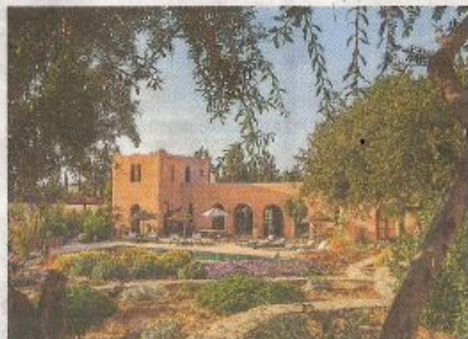
TRANQUIL: The hotel's lush gardens offer space to soak up the sunshine