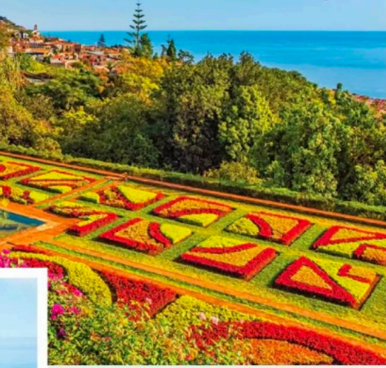
Visit the island's colourful botanical gardens

It's an adrenaline-filled ride that requires a glass of fortified Madeiran wine to calm your nerves once you get to the bottom.