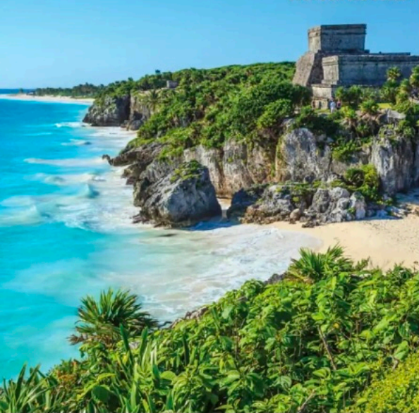
The ruins at Tulum overlook the ocean

incredible breakfast buffet. Served until midday, it includes delicious Mexican specialities such as Chilaquiles (eggs on crispy corn tortillas in a red or green salsa). And after a refreshing dip in the sea, you'll be ready to do it all again – as far from the winter blues as it's possible to be.